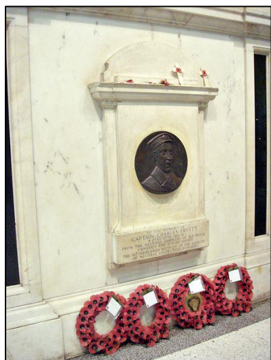
Captain Fryatt’s memorial in Liverpool Street Station.