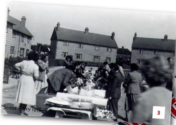
Street Party 1953