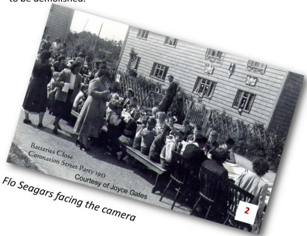
Batteries Close Coronation Street Party 1953 Flo Seagars facing the camera