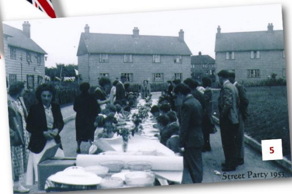
Street Party 1953