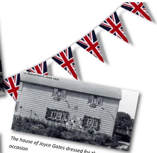
The house of Joyce Gates dressed for the occasion