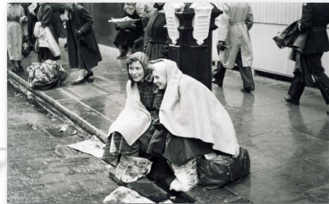
Undaunted revellers on the streets of London