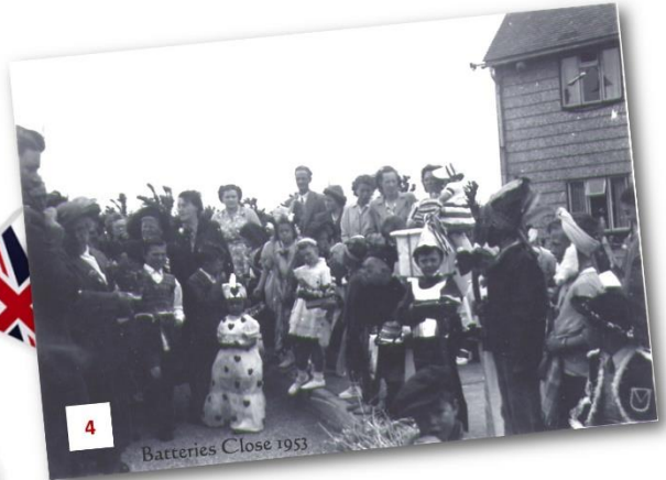
Batteries Close 1953