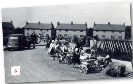
6 Fancy dress parade