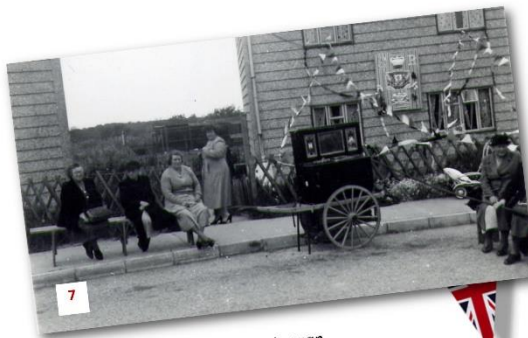
7 Party to the sound of the barrel organ